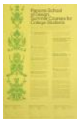
Parsons School of Design Summer Courses for College Students (PIC05007-1_OSxxx1_f04_07)