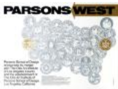
Parsons West: Parsons School of Design Announces Its Merger with the Otis Art Institute of Los Angeles County (PIC05007-1_OSxxx1_f04_02)