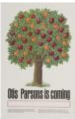
Otis/Parsons Is Coming (PIC05007-1_pOSx2_f02_03)