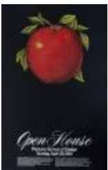
Open House (PIC05007-1_pOSx2_f03_05)