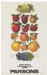
Parsons New York, Los Angeles, Paris (PIC05007-1_Tube1_03)