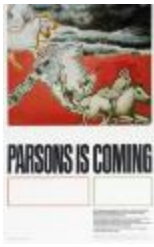
Parsons Is Coming (PIC05007-1_pOSx2_f01_04)