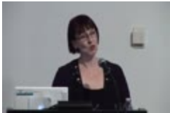
Gender Studies and Body Politics: Intersections, Directions, Representations (Session 3) (NS070205_000003)