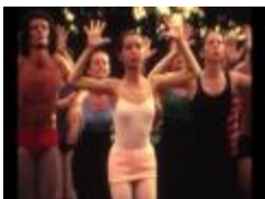
Teatro Romano Part 2 (KA0130_000005)