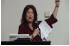
Gender Studies: What Histories Do We Want to Claim? (Session 2) (NS070205_000002)