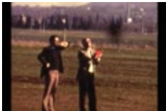
Viterbo (Unidentified 4) (KA0130_000009)