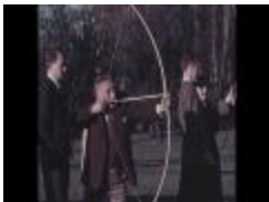
Barbecue at Old Mill, 1937 (Halle_16mm_02_H264)