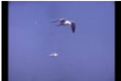
Coney Island (KA0130_000001)