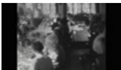
GATHERING OF UNIVERSITY PROFESSORS "Poundridge" 1935 (Halle_16mm_01_H264)