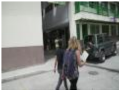
The International Field Program: Caldas, Colombia (IFP_Parts_1_and_2)