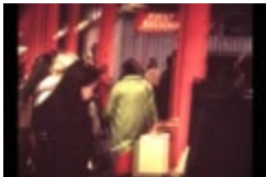
Partenza Michelangelo (KA0130_000002)