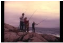
New York scenes (Unidentified 1) (KA0130_000006)