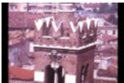
Ponte di Veia (KA0130_000003)