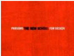
Parsons School of Design recruitment video (2015PC06_D005_LOGICAL VOLUME I)