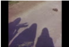
Study of Street Life on Upper West Side of Manhattan (KA0117_000001)