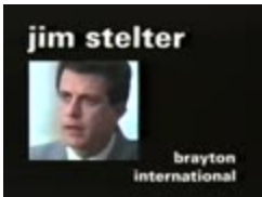
Brayton International / University of North Carolina, Greensboro Honors Studio (KA0119_VHS_02)