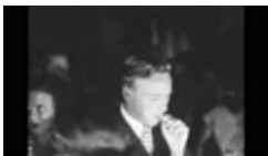
Parsons Paris 1948 (PC070201_000001)