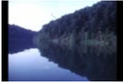
Zambonini family camping trip (Unidentified 2) (KA0130_000007)