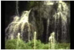
Villa d'Este (Unidentified 3) (KA0130_000008)