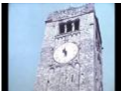
Teatro Romano Part 1 (KA0130_000004)