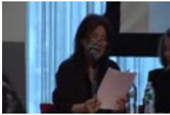
The State of the Art: Gender Studies (Session 1) (NS070205_000001)