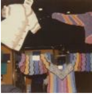
Fashion Group Exhibit (KA0023_000010)