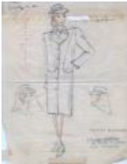
Drawing of Uniform for Public Health Nurses by Edith d'Errecalde for Mainbocher (KA0023_k04_f04_02)