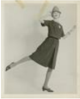
The Stocking, Modern, Magnificent (KA0023_000007)