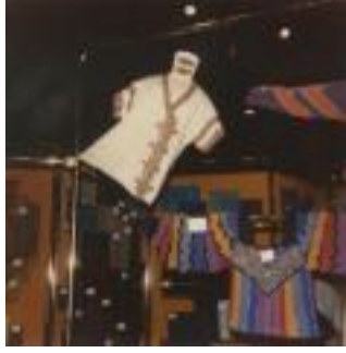
Fashion Group Exhibit (KA0023_000011)