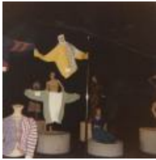
Fashion Group Exhibit (KA0023_000012)