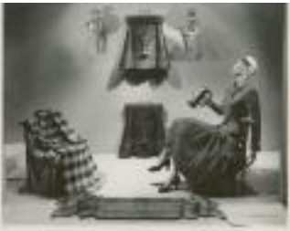
Saks Fifth Avenue Store Window (KA0023_000008)