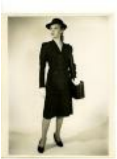
Public Health Nurse (KA0023_b01_f11_01)