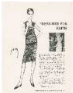
Designed for Stretch by Edith d'Errecalde (KA0023_000005)