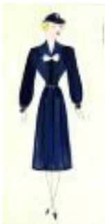
Public Health Nurse Uniform Drawing (KA0023_k04_f04_03)