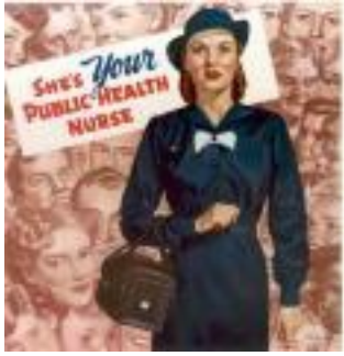
She's Your Public Health Nurse (KA0023_kOSxx2_f06_01)