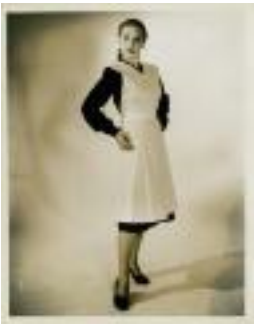
Public Health Nurse Uniform Consisting of Dress and Apron (KA0023_000002)