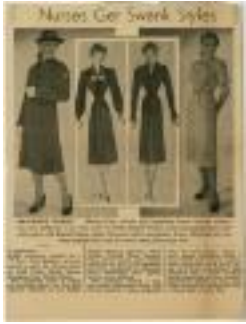
Nurses Get Swank Styles (KA0023_000001)