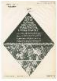
American Viscose Advertisement in Women's Wear Daily (KA0023_000003)