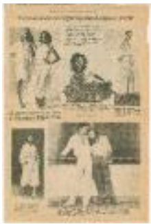
Casual Is the Word for Spring-Summer 1978 (KA0023_000004)