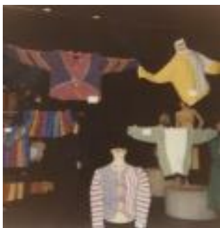
Fashion Group Exhibit (KA0023_000009)