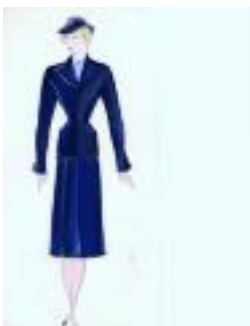
Public Health Nurse Uniform Drawing (KA0023_k04_f04_01)