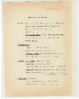
Shopping List New York (KA0023_000016)